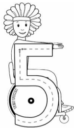
"Down her back, round you go, Now arms out straight, don't be slow!"

Home Learning Challenge (optional): Explore the number five with your child. Can they carry out practical sets of five e.g. five claps, five jumps etc. Use their toys to make different sets e.g. 1 teddy, 2 dinosaurs, 3 cars, 4 trains, 5 books. Can they match the numbers 1, 2, 3, 4 and 5 to the right set? Can they make sets of 1, 2, 3, 4 and 5 objects, counting them out from a larger set? Can they spot numbers out and about e.g. house numbers? Photos can be sent to nursery@st-nicholas.staffs.sch.uk .